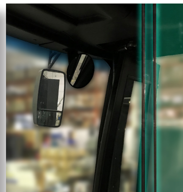
(green cast shows stowed SVP Driver Shield red cast shows room for farebox)